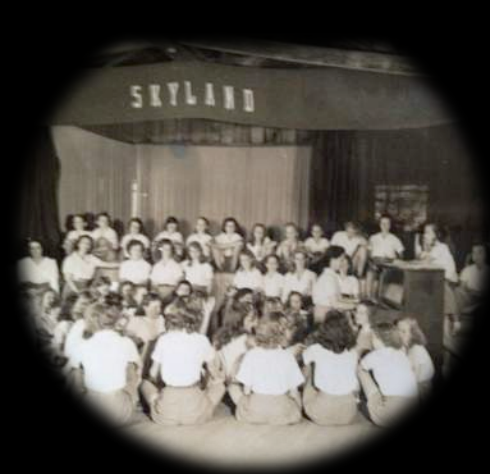
Then: Camp songs are a favorite tradition. Now: The faster and louder the songs, the better!