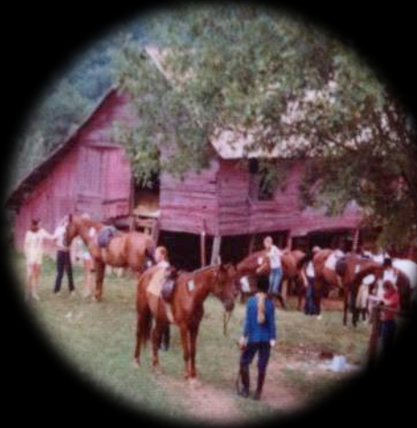
Then: The barn houses Skyland's horses. Now: Recent upgrades in the new barn include wash racks and paddocks.