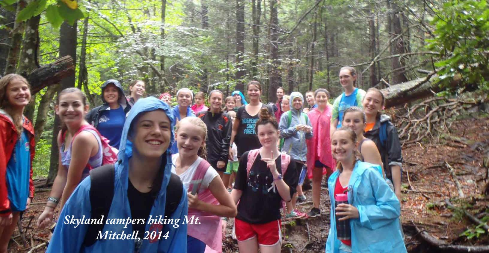
Skyland campers hiking Mt. Mitchell, 2014