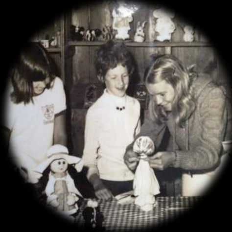
Then: Campers tap into their creativity. Now: Recycled Arts uses natural & recycled materials.