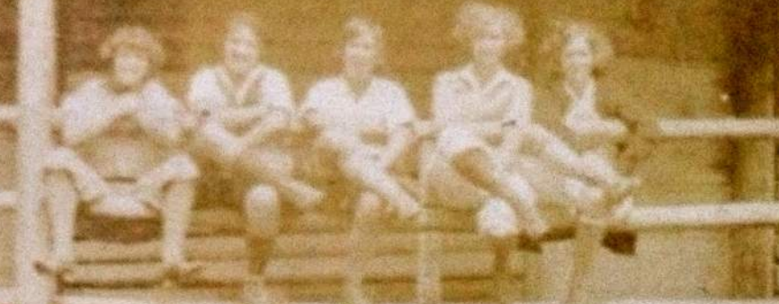
Skyland campers atop Mt. Mitchell, 1920s

Even decades later, stepping onto Skyland Hill can feel like unearthing a time capsule. While facilities are upgraded and programs are added, many of the same essential elements continue to define the Skyland experience today. See how 2014 campers experienced some of our favorite traditions in Skyland history.